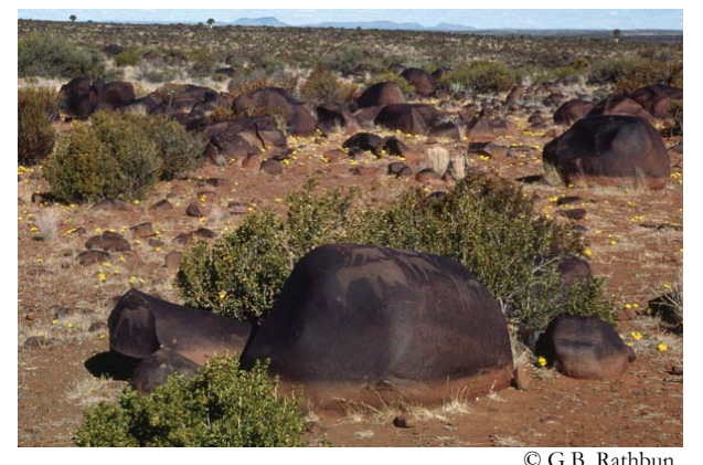
Figure 3 : Sengi engravings are on these large black boulders located in the Karoo bushland in Northern Cape Province, South Africa.

In August 2001, Janette, Craig, Lynn and I met at the engraving site on a private farm in the Northern Cape Province of South Africa. The area is part of the vast Karoo bushveld, but the site is unique because of numerous scattered black boulders (Fig. 3), many with engravings of humans, ostriches, elephants and various species of antelopes. Only a pair of boulders, however, included images of sengis. Janette showed me the two boulders and upon close examination of the extraordinary sengi images (Fig. 4) I was shocked: each of the five engravings included the unmistakable tails of Petrodromus (Fig. 5).