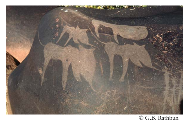
Figure 4: Sengi engravings on boulders in the Karoo bushland.

might be used as brushes to build and maintain the meticulous paths through the leaf litter that are characteristic of Petrodromus , but I suspected that the bristles were related to scent marking. I provided some preserved tail tissue to a Russian colleague, who documented that each bristle was associated with large sweat and sebaceous glands (Sokolov et al. 1980). The scent-marking hypothesis was further supported when I observed horizontal tail-lashing on the substrate associated with aggressive encounters between pairs of captive animals.