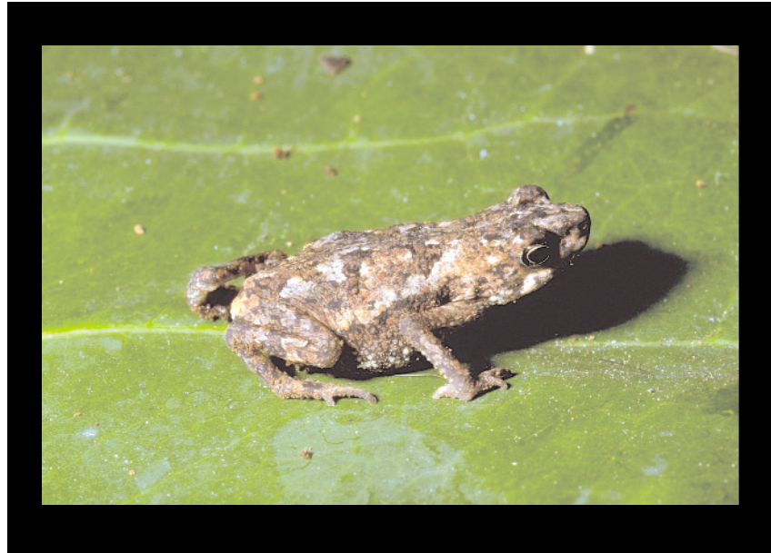
Mertensophryne micranotis Arabuko-Sokoke Forest