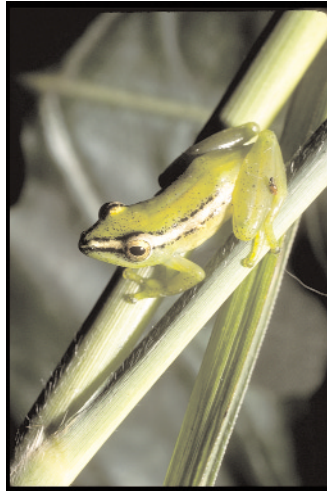
Hyperolius parkeri Arabuko-Sokoke Forest