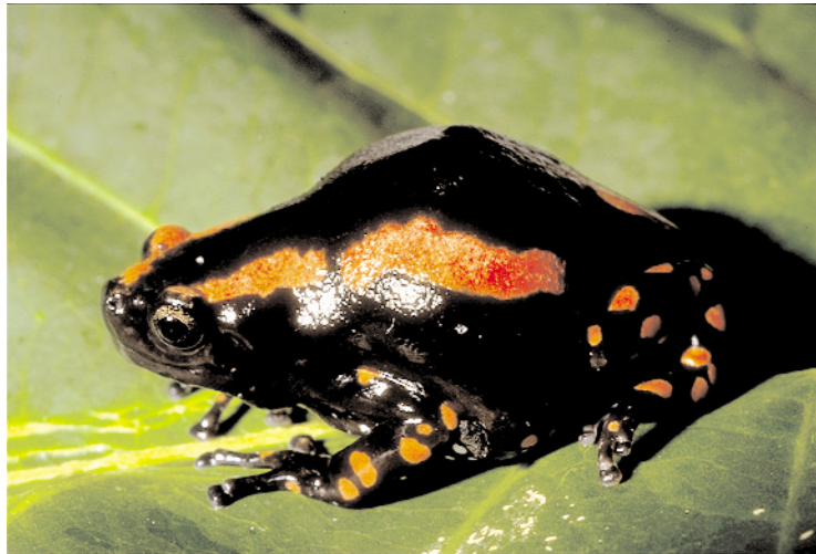
Phrynomerus bifasciatus Arabuko-Sokoke Forest