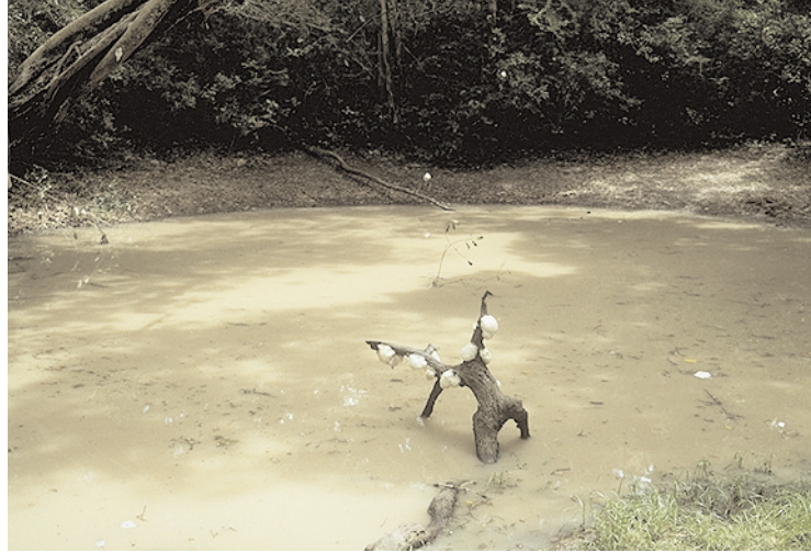
Chiromantis xerampelina nests Arabuko-Sokoke Forest