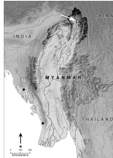
FIGURE 4. Distribution of Rhacophorus htunwini sp. nov. in Myanmar with type locality indicated by a star (at tip of arrow).

The type specimens including the holotype (CAS 229913, USNM 561869) were found approximately 2 m off the ground in bamboo. Referred specimens were found in undisturbed habitat near a spring (CAS 222136) or seasonal (CAS 221351) and permanent (CAS 222065) streams. Other species of Polypedates and Rhacophorus found in the vicinity of the type locality were P. leucomystax , R. bipunctatus , and R. dennysi .