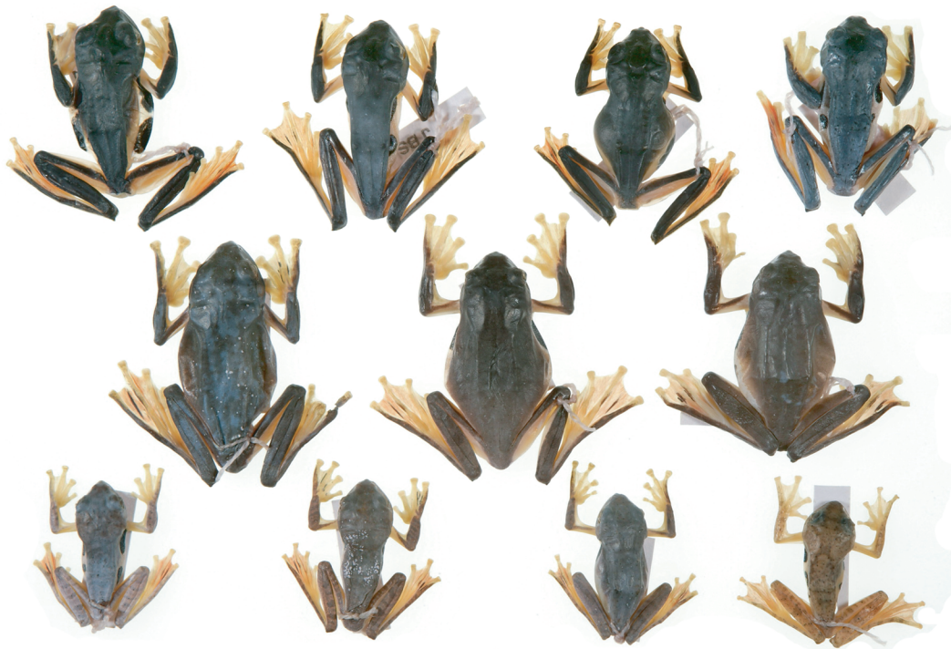
FIGURE 3. Dorsal view of representative specimens of Rhacophorus htunwini sp. nov. (top row), representative specimens of female R. bipunctatus (middle row), and representative specimens of male R. bipunctatus (bottom row).

the R. malabaricus species group ( R. calcadensis and R. malabaricus ), R. lateralis , R. pseudomalabaricus , and R. turpes by axillary spots.