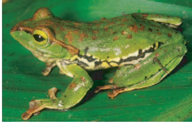
FIGURE 2. From a color transparency of Rhacophorus taronensis (MBM-JBS 11793).

VARIATION. — Further observations were made on specimens newly collected from Myanmar. On several specimens (CAS 224370–224371, 224382, 224397, MBM-JBS 11793; Joseph B. Slowinski field number to be deposited in the MBM) the spotting on the flanks is white, more reticulate, and continues onto the ventral surface (Fig. 2). The brown spotting on the back may be very extensive (CAS 224371, 224377, MBM-JBS 11793) (Fig. 2) or absent (CAS 224369–224370, 224379).