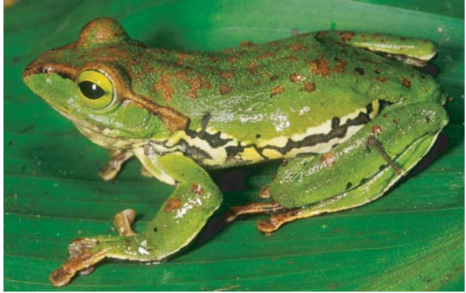
FIGURE 2. From a color transparency of Rhacophorus taronensis (MBM-JBS 11793).

VARIATION. — Further observations were made on specimens newly collected from Myanmar. On several specimens (CAS 224370–224371, 224382, 224397, MBM-JBS 11793; Joseph B. Slowinski field number to be deposited in the MBM) the spotting on the flanks is white, more reticulate, and continues onto the ventral surface (Fig. 2). The brown spotting on the back may be very extensive (CAS 224371, 224377, MBM-JBS 11793) (Fig. 2) or absent (CAS 224369–224370, 224379).