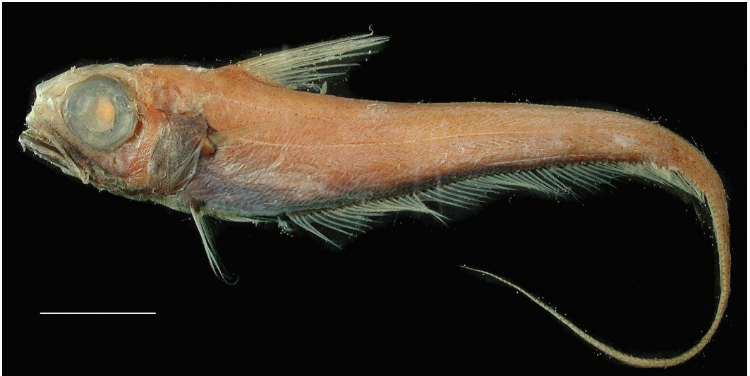
FIGURE 1. Lepidorhynchus denticulatus , BPBM 39286 (31.5 mm head length, 200 mm total length), from off Oahu, Hawaii.

COUNTS AND MEASUREMENTS. — (Hawaiian specimen first, followed by range of Australian specimens in parentheses.) First dorsal-fin rays II,11 (10–12); pectoral-fin rays i17 and i16 (i15–i18); pelvic fin rays 9 (9); branchiostegal rays 6; gill rakers first arch (outer/inner) 0+11 / 3+13 (0+10–14 / 3–4+13–15 = 17–18), second arch 3+14 / 2+13 (2–3+12–15 = 14–17 / 2–3+12–14 = 14–17); scale rows below origin of first dorsal fin about 8 (about 7–8), below mid-base of first dorsal fin about 5 (5.5), below origin of second dorsal fin about 6 (5–6.5); pyloric caeca 16 (15–25). Head length 31.5 mm (41.7–70.3 mm); the following in mm for Hawaiian specimen followed in parentheses by percent of head length for Hawaiian specimen and then Australian specimens: snout length 7.6 (22%, 20–24%); preoral length 5.1 (16%, 9–13%); internasal width 6.8 (22%, 16–21%); interorbital width 8.8 (28%, 20–25%); orbit diameter 12.6 (40%, 35–39%); suborbital width 2.8 (9%, 8–8%); postorbital length 12.6 (40%, 41–45%); distance orbit to angle of preopercle 11.9 (38%, 39–42%); length upper jaw 15.3 (49%, 47–50%); length barbel 3.1 (10%, 9–15%); length