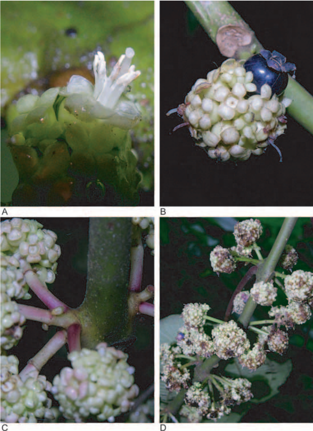
FIGURE 2. Clidemia almedae . A. flower; B. fruit; C. and D. inflorescences. (From live material of Kriebel & Ortiz 5106)