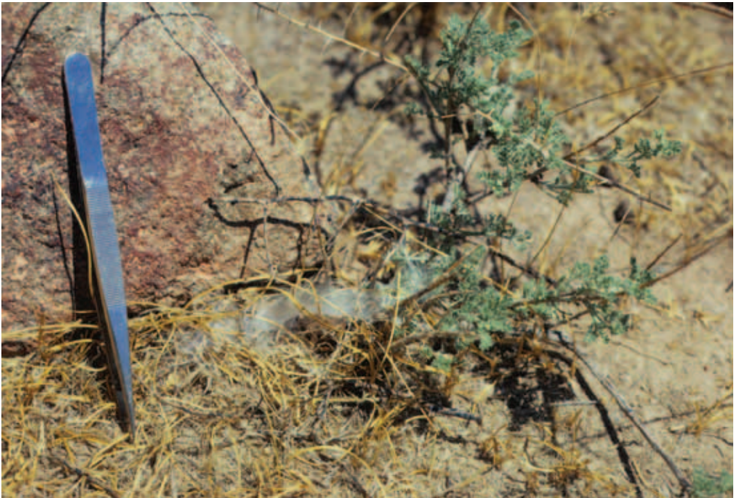
FIGURE 4. Gallery of P. afghanica extended into Artemisia shrub to collect leaf fragments to be accumulated in the burrow as a food provision.

forty centimeters (Figs. 5–6). As expected, this gallery contained a very large mature female (body length about 25 mm). At the burrow's end was an accumulation of freshly-collected Artemisia leaf fragments.