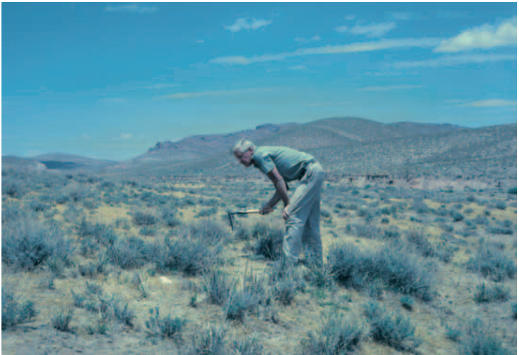
FIGURE 3. Author at type locality of P. afghanica , 50 km S of Herat, Afghanistan, 1700 m elev., early May, 1970. Vegetation: Artemesia shrubs, bunch grass, iris and other wildflowers.

My search for Paedemia was about to be abandoned until unexpectedly I saw a large, grayish white silky gallery extending up from a burrow into twigs and foliage of a low Artemesia shrub (Fig. 4). Similar galleries were soon found in other artemesias. Each extended into a burrow, which sheltered an adult male Paedemia at a depth of only ten centimeters. A much larger gallery, about 8 cm in diameter, was excavated with difficulty as it penetrated between stones to a depth of about