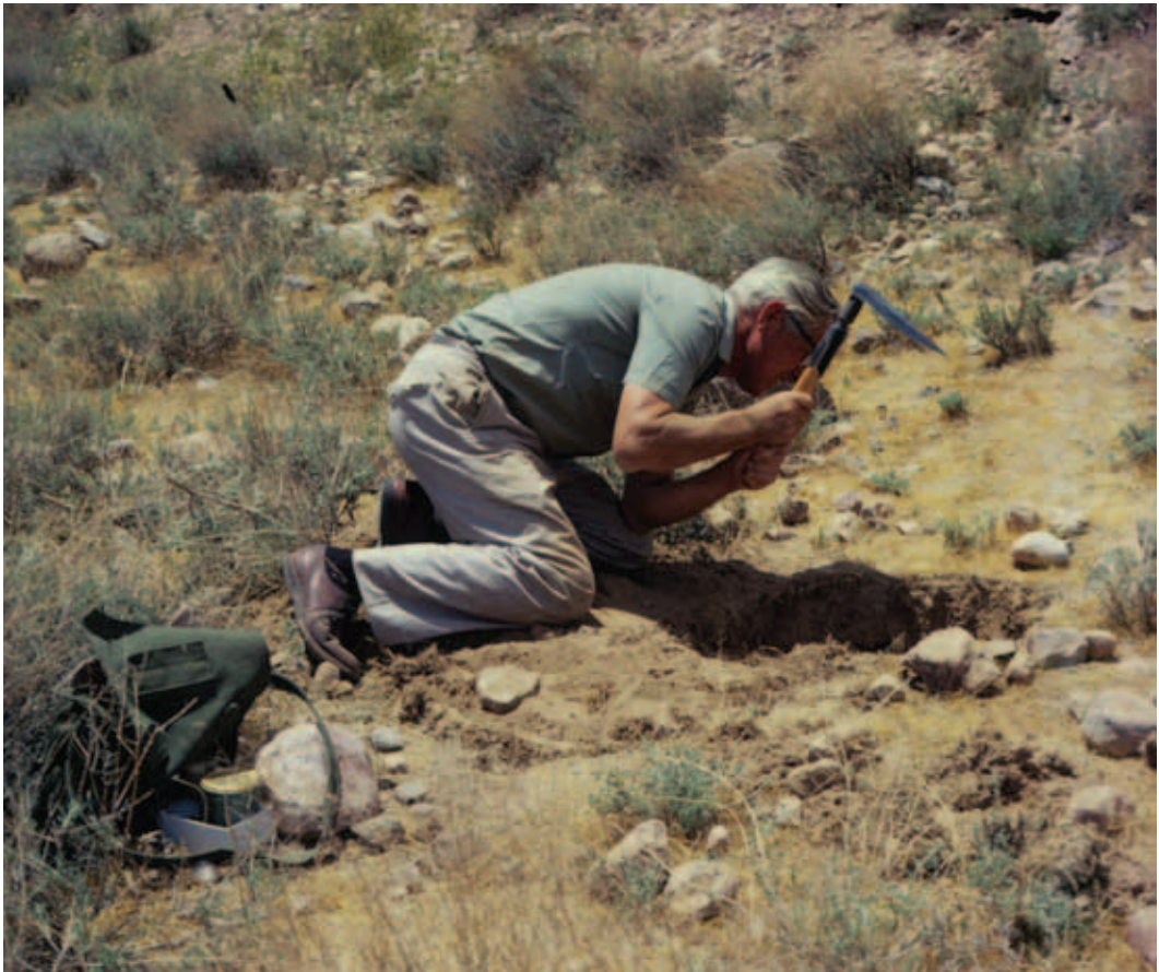
FIGURE 5. Author excavating a burrow of a female P. afghanica .

extended upward into an adjacent shrub, but others had been spun on the ground's surface and were filled with earth. Apparently they served as "dumps" for excavated soil.