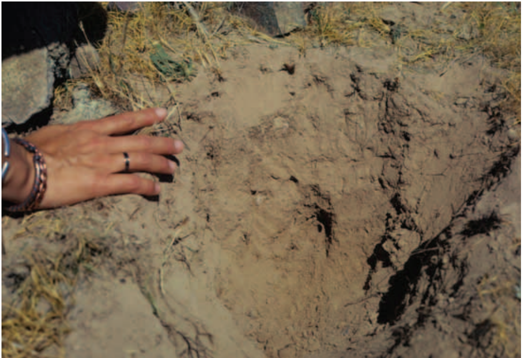
FIGURE 6. Burrow of a female P. afghanica partly excavated; extends to a depth of forty centimeters.

LABORATORY CULTURING.— In San Francisco, several Paedembia afghanica cultures were maintained. Some nymphs simply transformed into adult males and after presumed mating, they were preserved as specimens. Most nymphs died and it was apparent that the species has very low culture vigor.