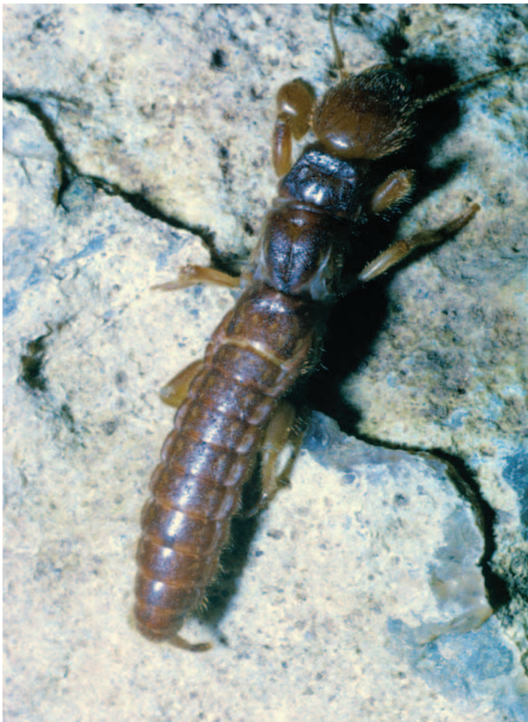
FIGURE 1. Appearance (alive) of an adult male of Paedembia afghanica sp. nov. Note peculiar medial mesonotal furrow and the downward projection of the cerci; conditions found only in Paedembia . Body length 18 mm.