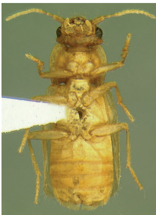
FIGURE 2. Xenaroswelliana deltaquadrant Erwin, male, ventral aspect.