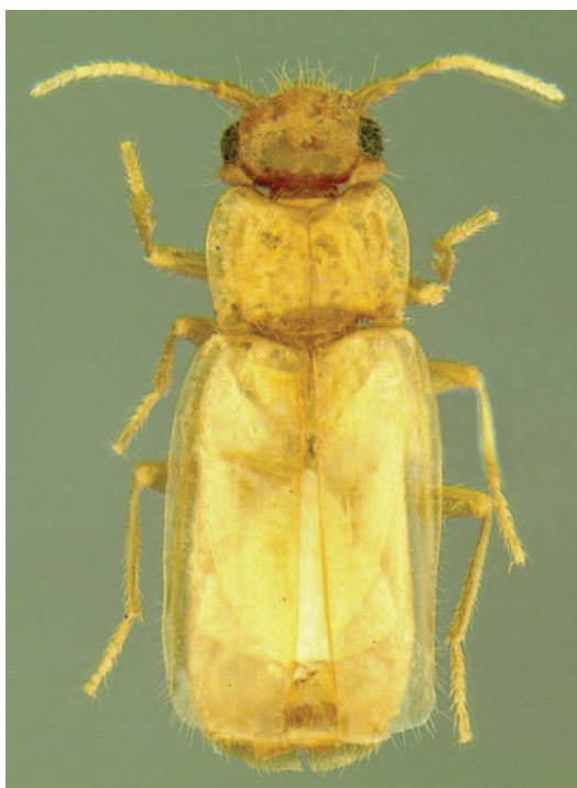
FIGURE 1. Xenaroswelliana deltaquadrant Erwin, male, dorsal aspect.