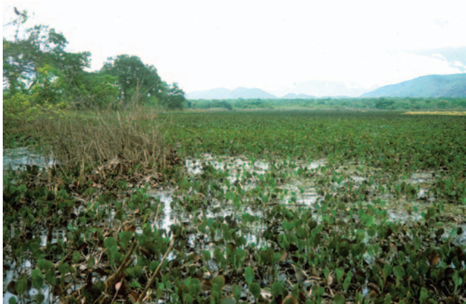
FIGURE 6. The vegetation and water body at the type locality in Goiás State, Brazil.