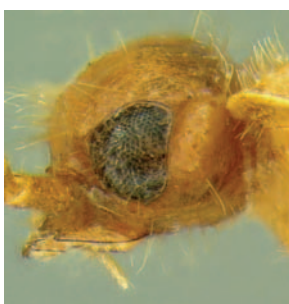
FIGURE 3. Xenaroswelliana deltaquadrant Erwin, male, head, lateral aspect.

sparsely setiferous. Metathoracic wing fully developed, no doubt functional. Trochanter narrowed apically, acute. Abdomen: Sternum III-IV fused. All visible sterna sparsely setiferous on disk, each with numerous long stout setae along apical margin. Male genitalia: (Fig.