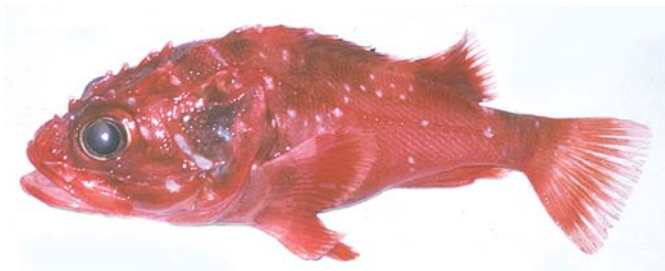
FIGURE 3. Paratype of Trachyscorpia osheri sp. nov., CAS 86504, 135 mm SL, photographed approximately four hours after capture and prior to preservation.