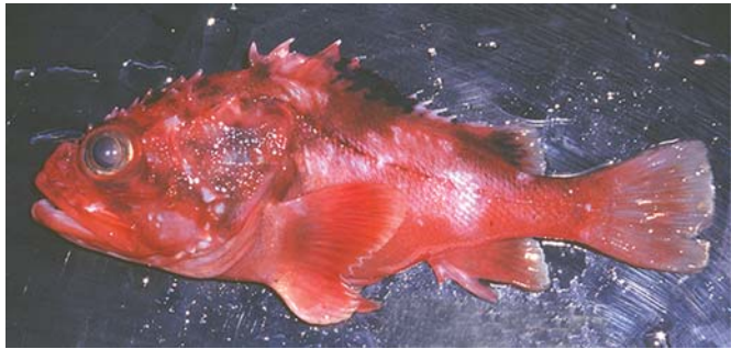
FIGURE 2. Holotype of Trachyscorpia osheri sp. nov., CAS 86509, 147 mm SL, photographed approximately four hours after capture and prior to preservation.

of all fins except pelvic fins; scales on fins cycloid. Exposed cycloid scales covering pectoral-fin base and anteroventral surface of body; some scales embedded in thin skin. Lateral line sloping downward at tip of opercle.