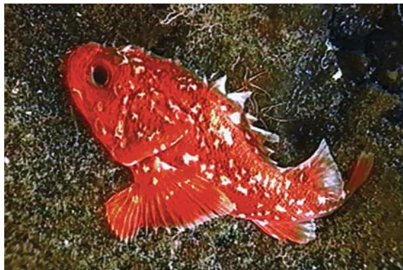
FIGURE 5. Idiastion hageyi photographed at Isla Fernandina, Cabo Douglas, at 522 m, 16 November 1995.

absent. Preopercle with 4 spines; uppermost spine largest with a supplemental preopercular spine on its base; second to fourth spines flattened, without a distinct median ridge. Preopercle, between uppermost preopercular spine and upper end of preopercle, smooth, without serrae or spines. Upper and lower opercular spines simple, minute, each with a shallow median ridge. Space between upper and lower opercular spines without ridges. Posterior tip of upper opercular spine not reaching opercular margin; posterior tip of lower opercular spine just reaches opercular margin.