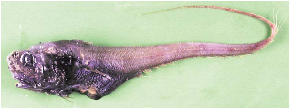
FIGURE 1. Asthenomacurus victoris , ZMUB 6267, 36.2 mm HL, 230+ mm TL, from 3036 m depth on Mid-Atlantic Ridge north of Azores.