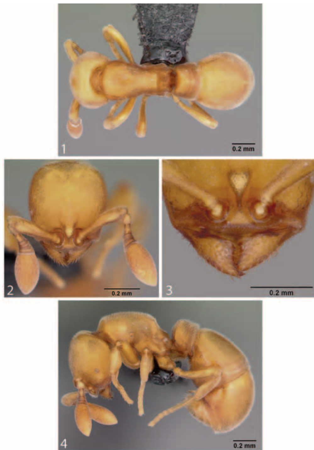
FIGURE 1-4. Discothyrea berlita worker: holotype CASENT0007016.