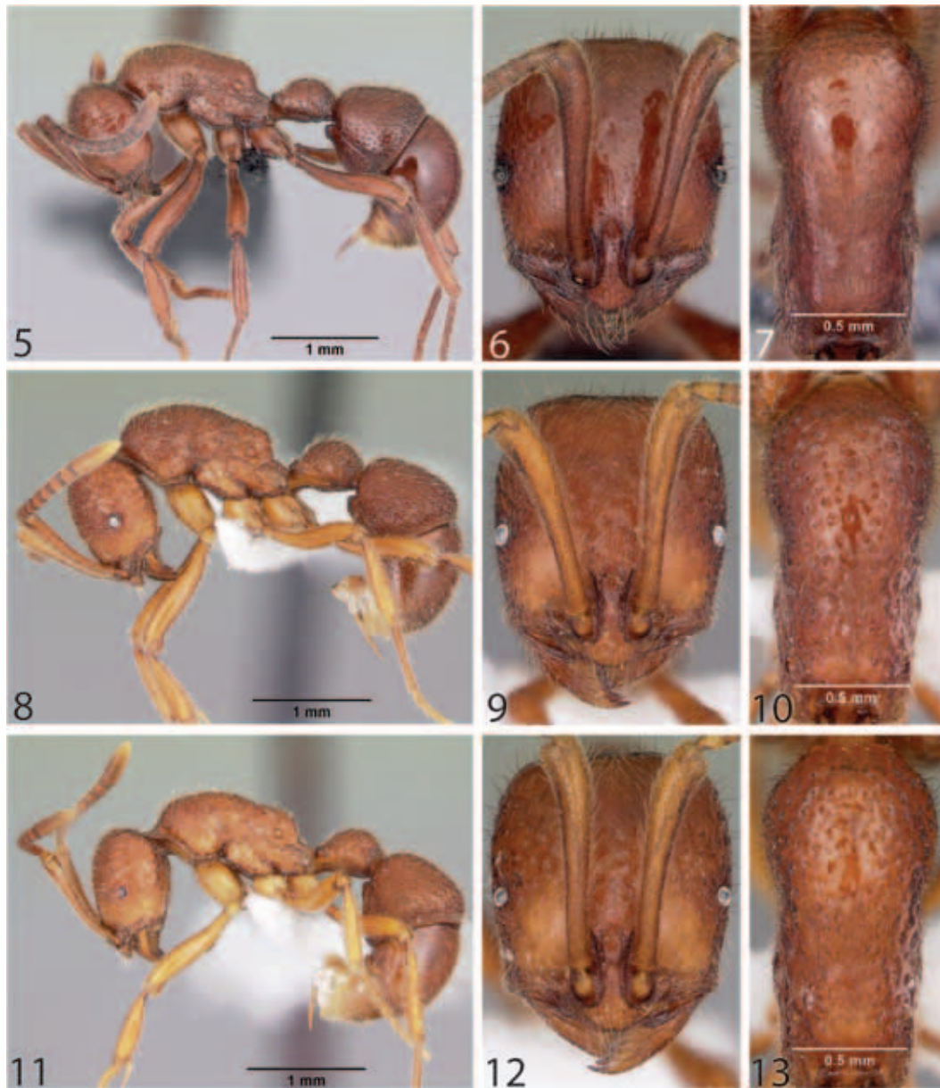
FIGURES 5–13 Profile, head in full-face view and mesosoma in dorsal view of Proceratium avium workers: Figures 5–7: CASENT0059014, BLF12136, collected May 30, 2005; Fig. 8–10: MCZTYPE32216 holotype of Proceratium avium collected 1 Apr. 1969; Fig. 11–13: MCZTYPE35017 holotype of Proceratium avioides collected 30 March 1969.

JUSTIFICATION OF SYNONYMY. — Brown (1980) collected three series of Proceratium at Le Pouce in 1969, one on March 30, and two on April 1. The latter were located less than 500 meters from the March 30 collecting site. He described both of these samples as Proceratium avium (Brown 1974). De Andrade (Baroni Urbani and de Andrade 2003) reexamined these three collec-