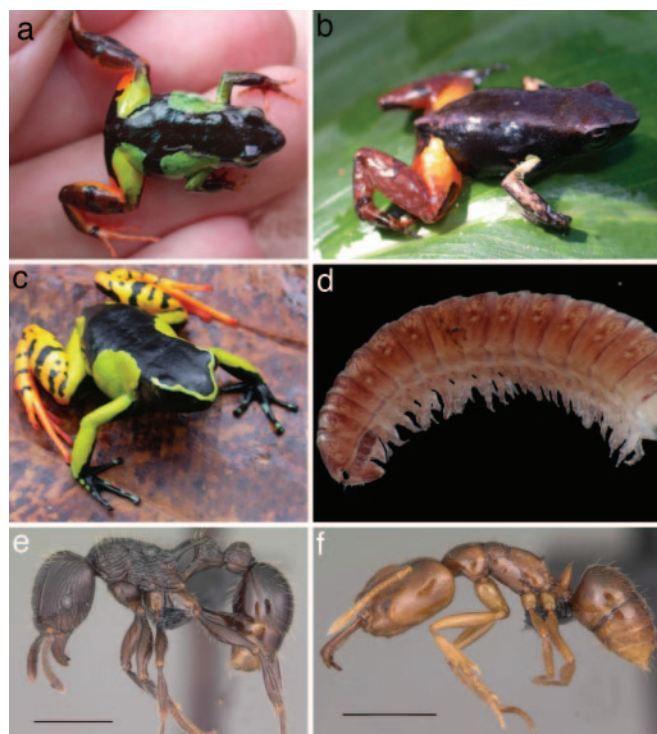
Fig. 1. Mantella poison frogs and their putative arthropod prey that contain the same defensive alkaloids. (a) M. madagascariensis (shown actual size). (b) M. bernhardi . (c) M. baroni . (d) R. purpureus . (e) T. electrum . (f) A. grandidieri . (Scale bars, 1 mm.)

Alkaloid Analyses. Methanol extracts of arthropods and frogs were analyzed for alkaloids by GC-MS on a GC-TOF mass spectrometer (GCT) (Micromass, Manchester, U.K.) in electron-impact and chemical-ionization (with NH 3 ) modes. A 30-m × 0.25-mm i.d.