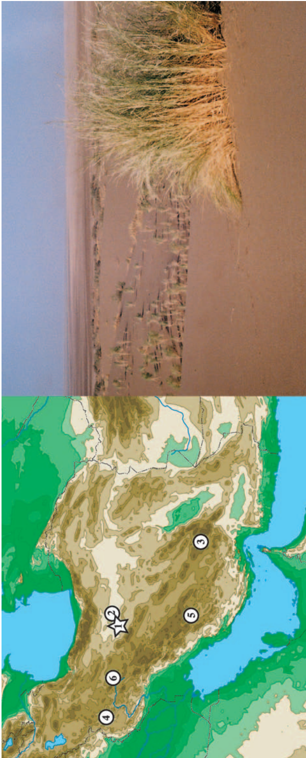
FIGURE 1. On the left, a map showing the localities of restricted-range species of Eremias endemic to Iran. 1 (star): Eremias kavirensis sp. nov.; 2: E. andersoni ; 3: E. talezharrica ; 4: E. montanus ; 5: E. nigrolateralis ; 6: E. novo . On the right, habitat at the type locality of Eremias kavirensis sp. nov.